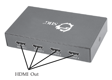
Figure 2 Rear Panel

HDMI Out (1-4): Connects to your HDMI displays